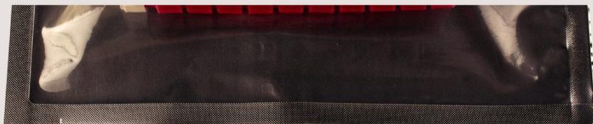
Right and above - two examples of the broad textured seal produced by the Shawseal.